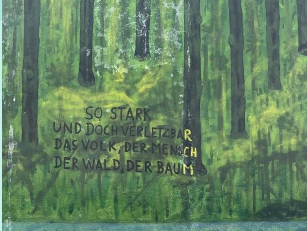
Ditmar Reiter, East Side Gallery