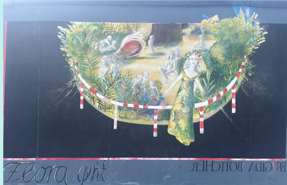
Brigida Böttcher, East Side Gallery